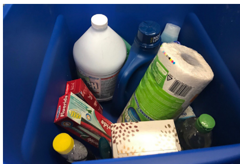
Baskets provided much-needed household and hygiene products

The donation in Montana helped support the needs of the most vulnerable during the COVID-19 pandemic, including seniors on fixed incomes and low-income families. Baskets filled with household cleaners and hygiene products, such as toothpaste, dish and laundry soap and shampoo, were distributed during the third week of May to families in need. They were able to drive up and receive the products.