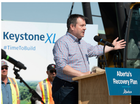
Alberta Premier Jason Kenney at Oyen pipe yard.

Alberta has always been a critical component of the Project. Not only does the energy province serve as the starting point for Keystone XL, but its hard-working men and women and elected officials have long recognized the need and benefits of the Project, and haven't been afraid to say it. To signify this support, the Government of Alberta recently invested $1.5 billion to help enable the vital completion of Keystone XL. Premier Kenney has been a longstanding vocal advocate of the energy industry and of the Project, we look forward to partnering with the Premier as we progress the Project.